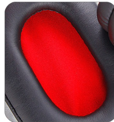
Extra soft ear pads