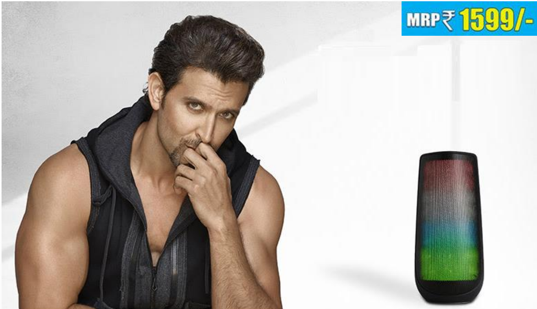
ZEB-PEAK Portable BT Speaker