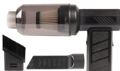
Vacuum Cleaning Kit