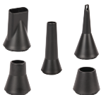
Precision Nozzle Attachments